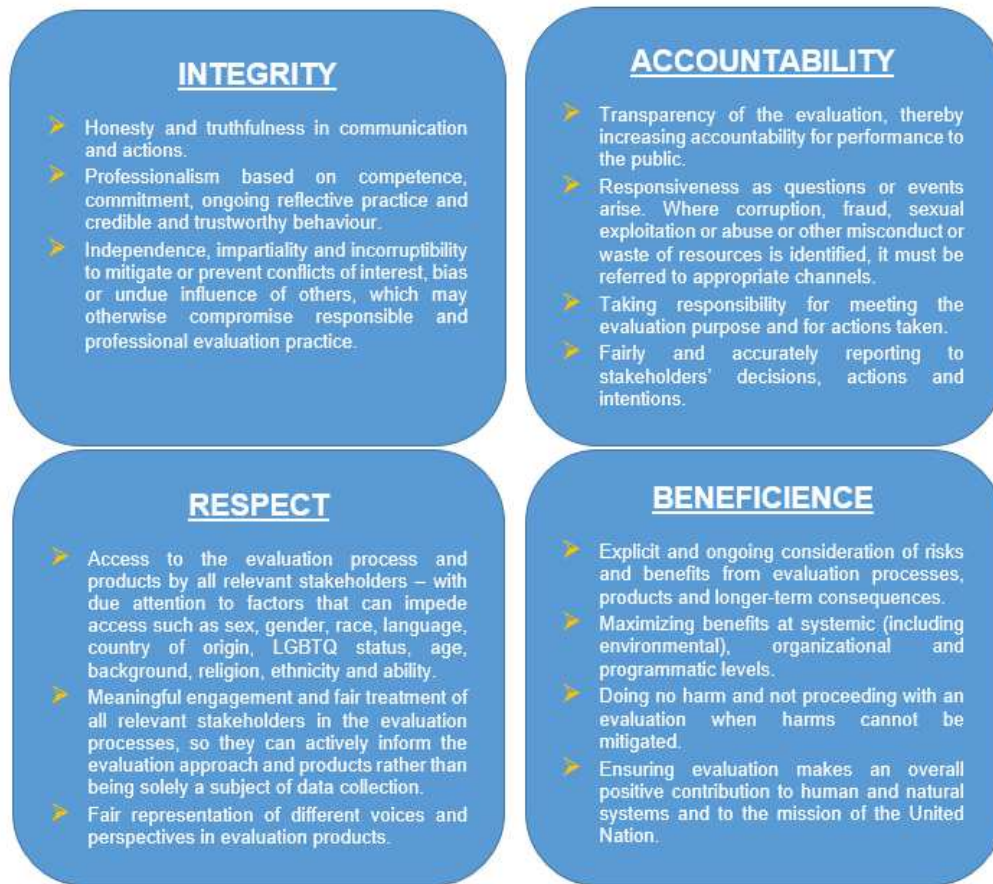
Figure 1: UNEG Ethical Guidelines for Evaluation (2020)